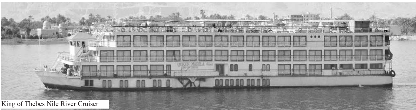
King of Thebes Nile River Cruiser

sail to the Botanical Gardens of the Aga Khan Mausoleum, Elephantine Island, Kitchener's Island. This evening reserved for professional activity.