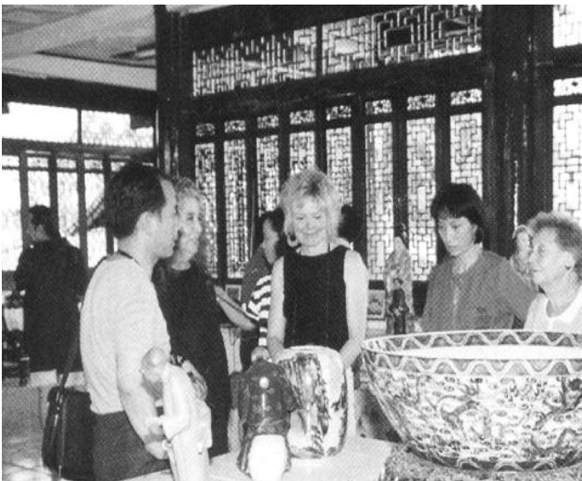
Shopping in China

The ancient Chinese said "There is a paradise in heaven but on Earth it's Hangzhou." Hangzhou, China's "Garden City" is renowned for its natural, exquisite and picturesque scenery history as one of China's six ancient capitals. In the Middle Ages Marco Polo visited Hangzhou and said "It is the most beautiful city in the world." Located by the Qiantang River