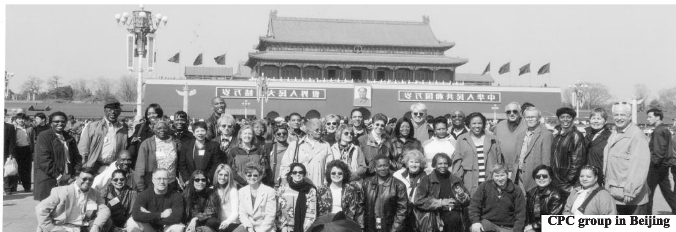
CPC group in Beijing

1-800-621-4414 / Fax 631-661-6914 cpcus@aol.com