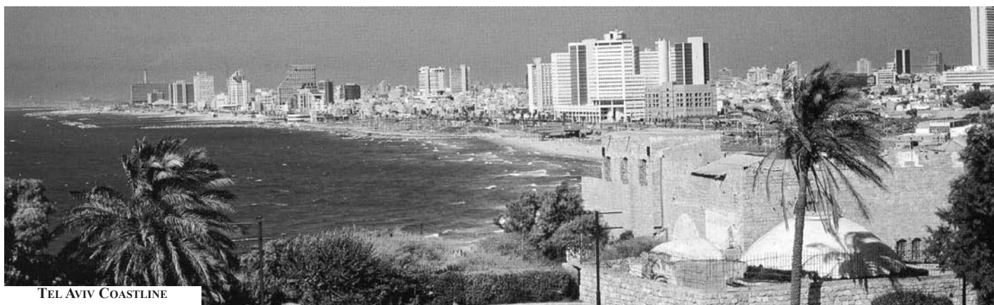
TEL AVIV COASTLINE

We start at Davidson Center , an archaeological tourist site exhibiting the history of the Temple Mount where you will be able to learn about 2,000 years of Jerusalem. The Davidson Center